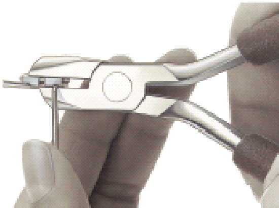
Bending with special pliers